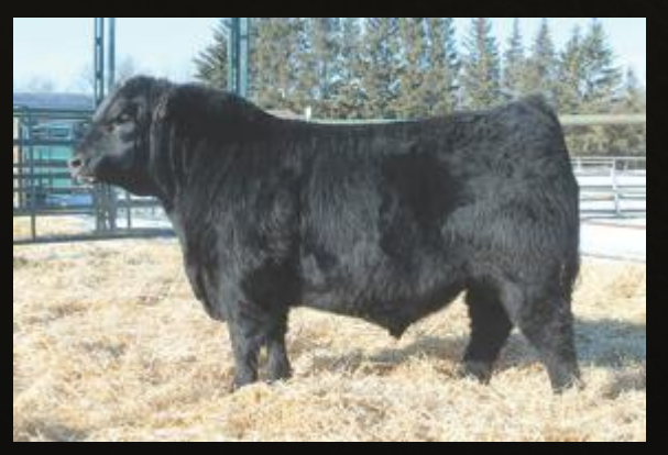
PEAK DOT EARNHARDT 164E