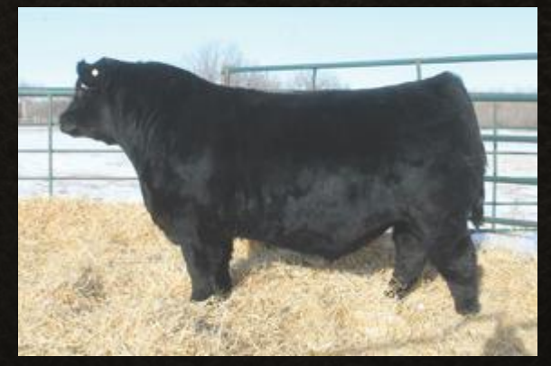
PEAK DOT HONOR 199E

An opportunity to select from the 300 plus purebred cow herd here at Triple S. We like this lot because of the tours with the people more than anything else. Building relationships with other programs is why we raise cattle. Together breeders make breeds better.